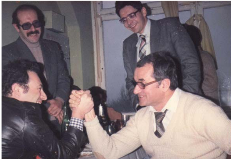
Sport competitions in the Nuclear Theory Department, 1988

The following picture is characteristic of how many of us have known him: